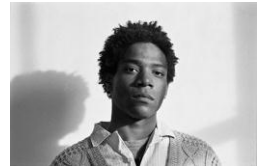
Jean-Michel Basquiat, 1984