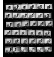
Jean-Michel Basquiat, 1984